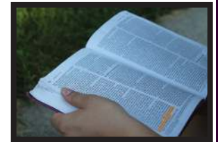
Morning Watch—a time spent in God's Word

Campers spend quiet time each morning reading their Bibles and a devotional. A little later in the day, they will