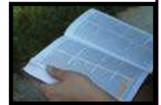
Morning Watch —a time spent in God's Word

Word as a cabin group. And in the evening, around a simple campfire, they'll hear from staff—testimonies or a message from God's Word. The night closes after a time of prayer and cabin devotions. All throughout the day staff remind the